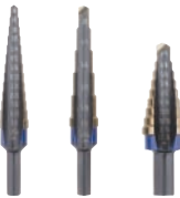
Barnes No. 998245 Mfg No. 10502CB