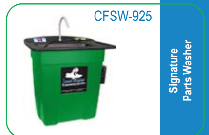
Signature Parts Washer