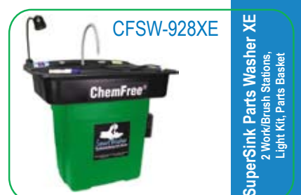
SuperSink Parts Washer XE 2 Work/Brush Stations, Light Kit, Parts Basket