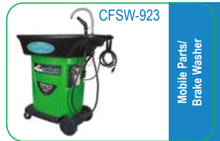
Mobile Parts/ Brake Washer