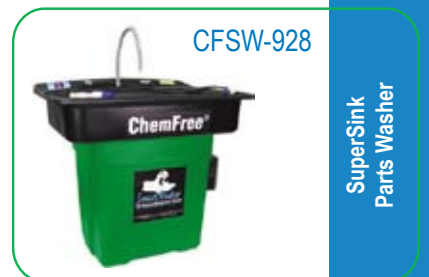
SuperSink Parts Washer