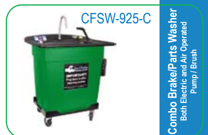
Combo Brake/Parts Washer Both Electric and Air Operated Pump / Brush